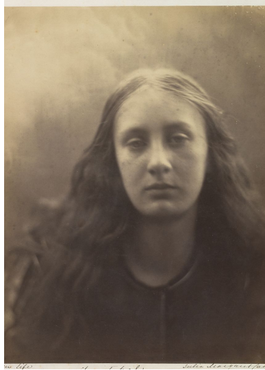
Julia Margaret Cameron