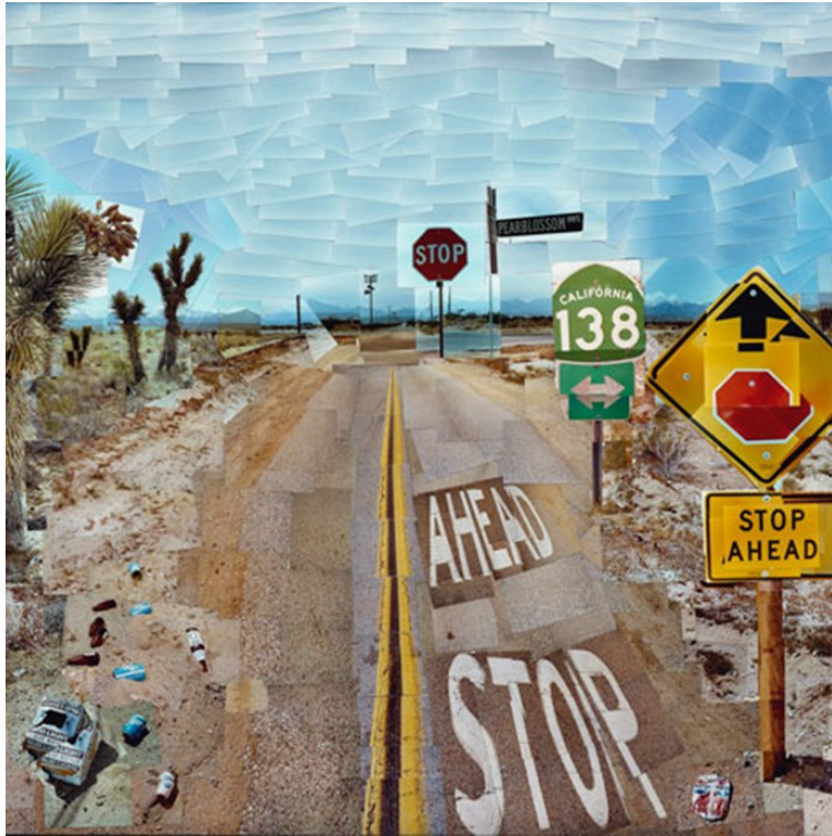
PHOTO JOINERS - DAVID HOCKNEY